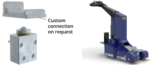
Rotating hitch with customizable connection