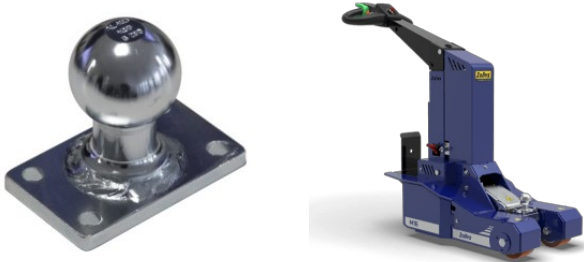
Tow ball hitch (upper block)