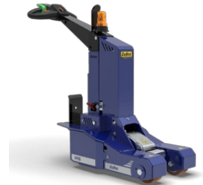
Support with flashing beacon