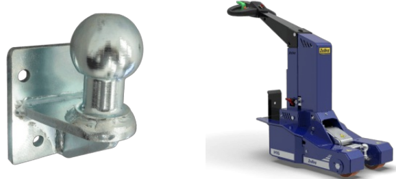
Tow ball hitch (frontal block)