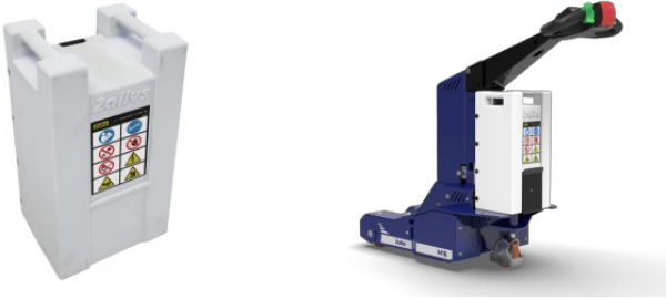
AGM battery pack - 37/45Ah