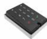
On/off keypad E506.750