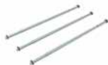
Ballasts fitting kit T528.700