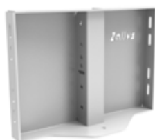
Adjustable connection for hitches ZG40.003.800