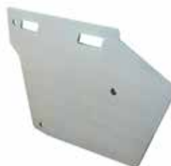
22 kg side ballasts (max 10 pcs. per side) Z196.850