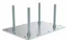
Fitting kit for ballast Z169.852