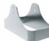
Rear wheel guard Z323.710