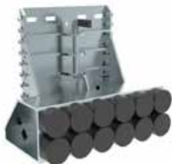
Pushing block A161.700